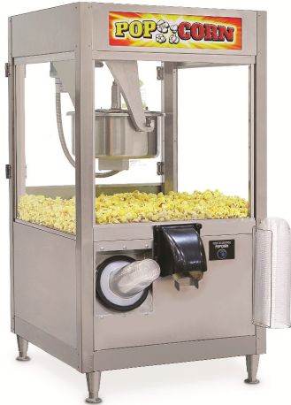
Countertop ReadyPop Unit