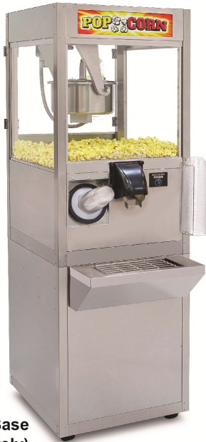
ReadyPop Unit on Base (items sold separately)